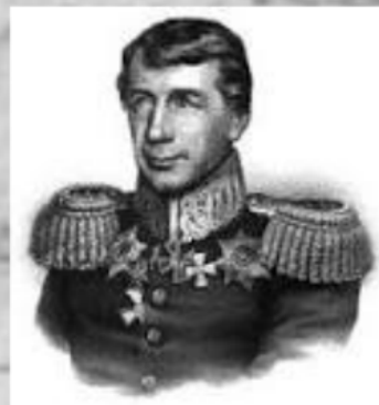
Ivan Fyodorovich Kruzenshtern

Adam Johann Ritter von Krusenstern((1770 –1846) Ivan Fyodorovich Kruzenshtern), was an admiral and explorer, who led the first Russian circumnavigation of the globe.